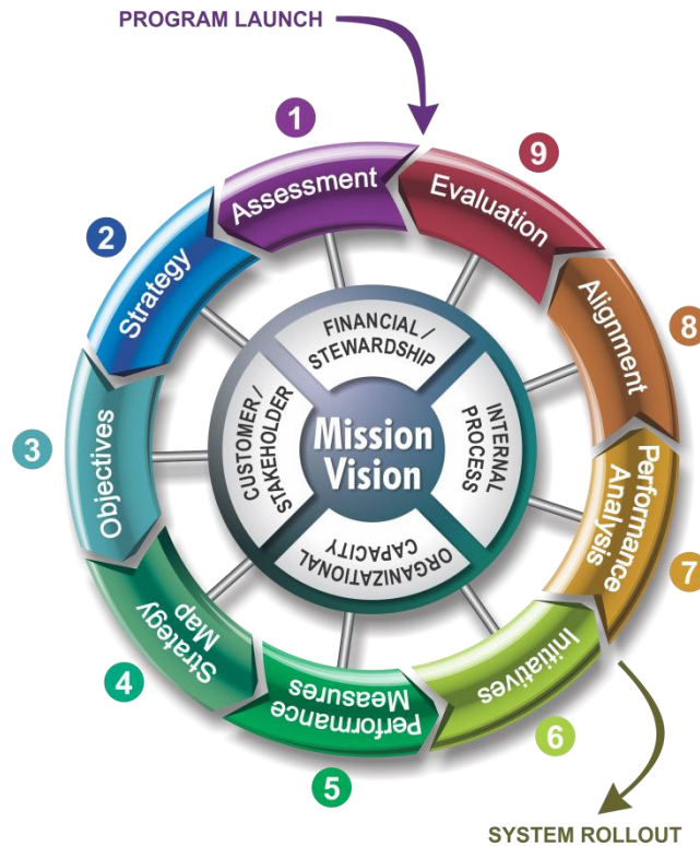
Figure 2: Balanced Scorecard Nine Steps to Success™ Framework

Alignment is one of the critical steps in building a strategic management system. The Institute uses the Nine Steps to Success™ framework shown in the figure below to develop and implement a full scorecard system. For organizations that already have built a scorecard but it is not a full strategic planning and management system, the steps can be used to make the existing scorecard more robust.